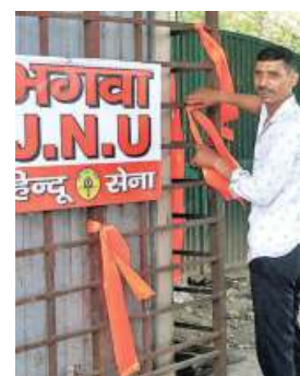
Delhi Police getting the posters removed near JNU on Friday