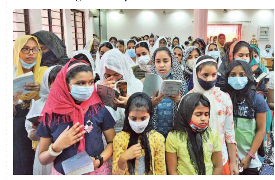
Women and young girls participate in Good Friday prayer at St. Stephen's Orthodox Church in New Delhi on Friday